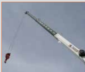
Exclusive sequenced two Stage Hydraulic Boom Extensions provide a total of 29 ft of reach.