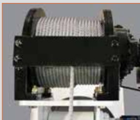
Planetary Winch provides the speed and power necessary for quick lifts and stowing.