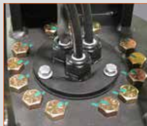
Sealed Center Rotation eliminates the need for a drip pan in the crane tower.