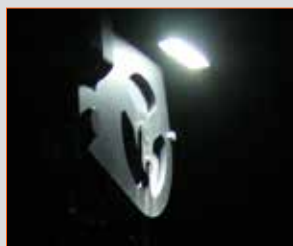
Boom Tip Light Option - Adds work area lighting directly below hook. Dual LED lights.

The 5031 is the smallest of the hydraulic cranes available from Tiger Cranes. Featuring self aligning hex boom design, all hydraulic extension, Auto II Speed, and a strong 30,000 ft/lb rating, the 5031 is a full feature hydraulic crane in a weight saving package.