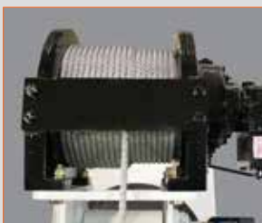
Planetary Winch provides the speed and power necessary for quick lifts and stowing