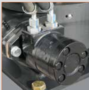
Double Reduction Full Power Rotation is very durable and trouble free.