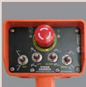
Optional Wireless Remote with Corded Tether adds work zone freedom to crane operation.