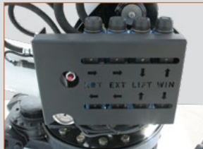
D03 Valve system provides reliable hydraulic control, indicator lights, integrated filtration, and manual overrides.