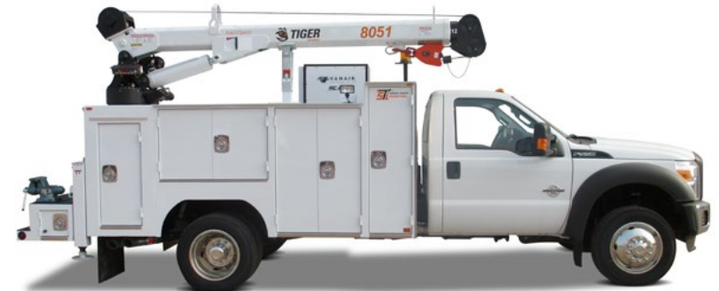
The 8051 is largest crane available to be mounted on a 19.5k GVW chassis. With 8,600 lbs of gross lifting capacity, 21 ft of full hydraulic reach, Auto II Speed control and high speed planetary winch, the 8051 will be your jobsite workhorse.