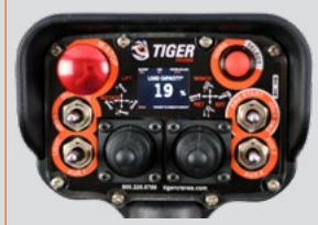
Standard wireless proportional crane and chassis control with digital crane load display.