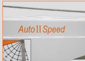
Auto II Speed automatically reduces the maximum working speed of all crane functions when a load is sensed.