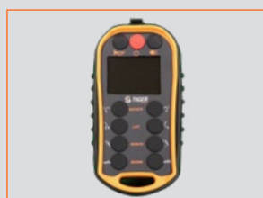
Standard wireless handheld remote with diagnostics.