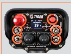
Optional wireless proportional crane and chassis control with digital crane load display.