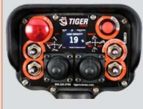
Standard wireless proportional crane and chassis control with digital crane load display.