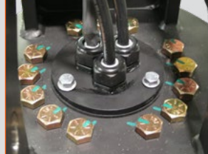
Sealed center rotation eliminates the need for a drip pan in the crane tower.