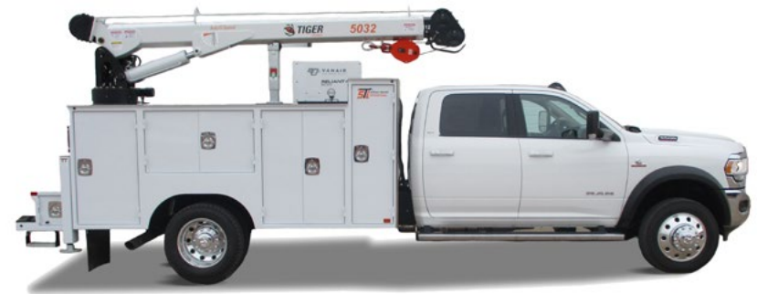
The 5032 is the smallest of the hydraulic cranes available from Tiger Cranes. Featuring self-aligning hex boom design, all hydraulic extension, Auto II Speed, and a strong 30,000 ft-lb rating, the 5032 is a full feature hydraulic crane in a weight saving package.