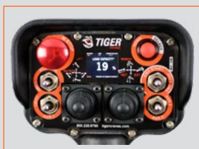
Optional wireless proportional crane and chassis control with digital crane load display.