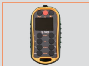
Standard wireless handheld remote with diagnostics.