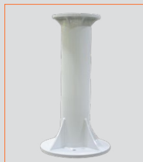
Optional 30" tall base.