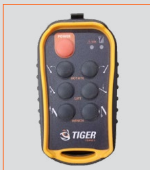
Standard ergonomic wireless hand-held controls.