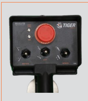
Optional remote with 25' tethered cord (no wireless functionality).