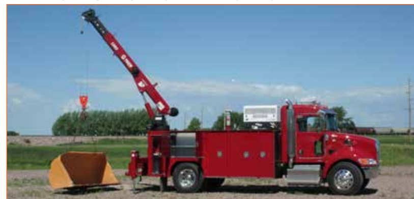
The 1069 Tiger Crane features 29 ft of hydraulic reach and 11,000 lbs of lifting capacity, all in a crane that can be mounted on a 25.5k GVW or larger chassis.