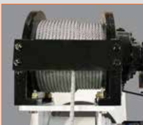
Planetary Winch provides the speed and power necessary for quick lifts and stowing.