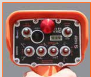
Wireless proportional crane & chassis control with digital crane load display.