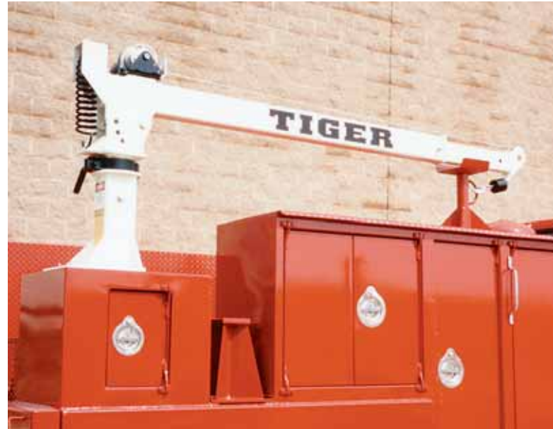
MODEL 2000 EL

The TIGER T2000EL utilizes a DC winch connected to the vehicles electrical system, and is available with a choice of two different height bases.