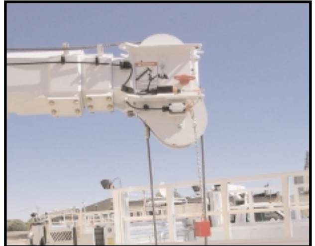
Anti-two block system integrity is maintained whether the X-Tender is deployed or not.