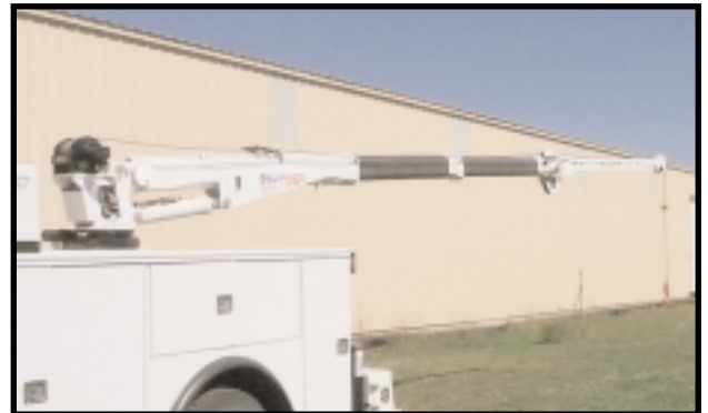
X-tender jib boom extended to the full 30'