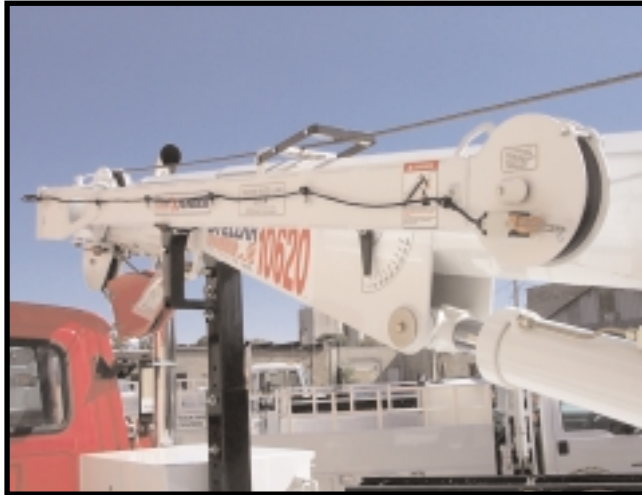
X-Tender folded and stowed