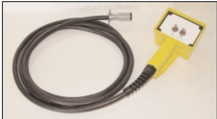
Tethered remote is removable for easy storage.